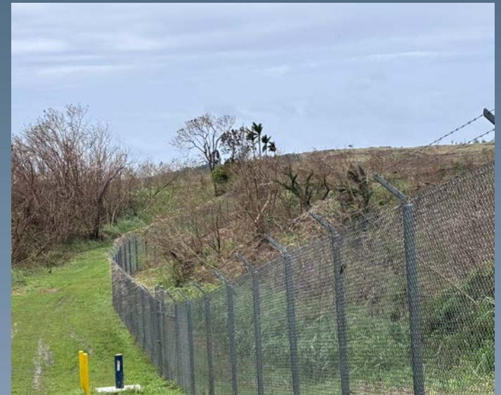
MW-14 Looking South along East Perimeter Fenceline on 4/16