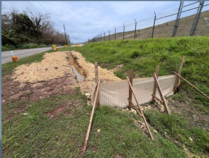
SVE Lateral Addition on 4/16