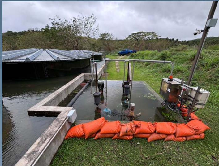
Flare Station – Looking East on 4/16