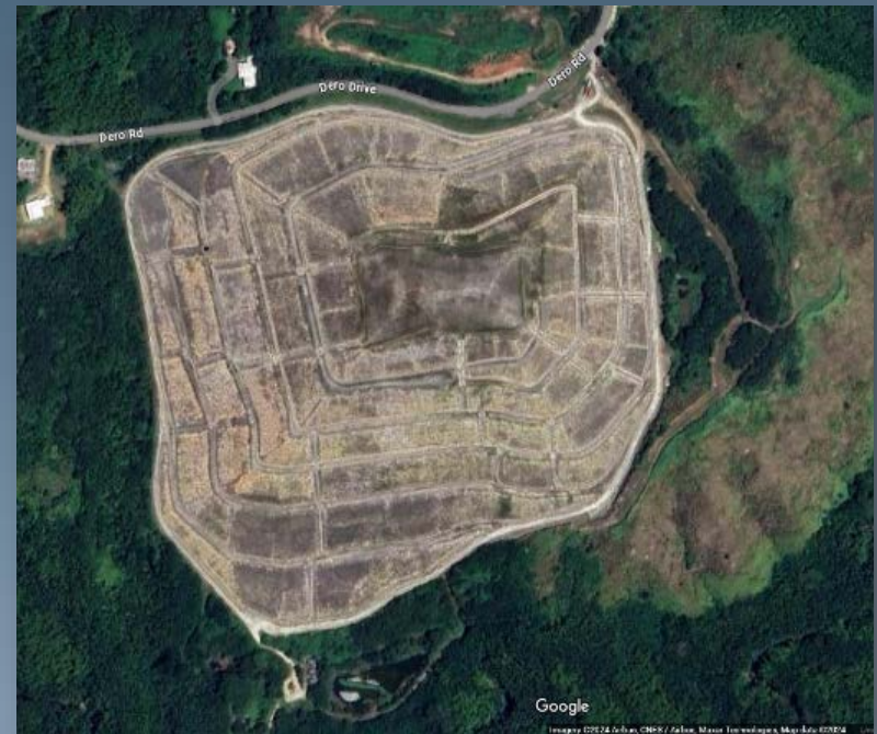
Ordot Dump, Ordot, Guam